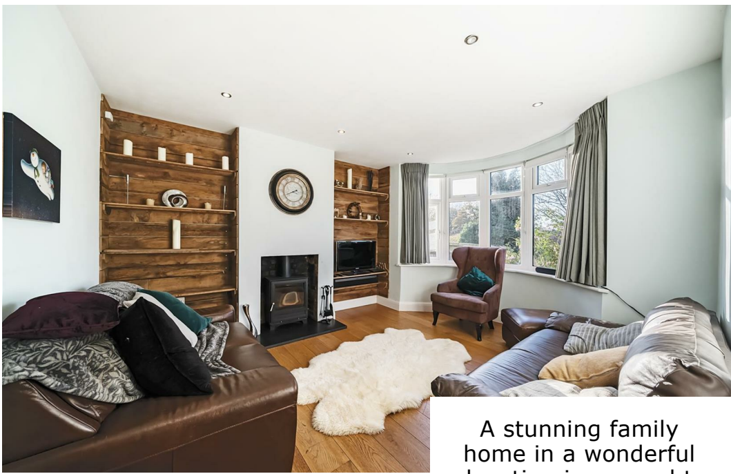
A stunning family home in a wonderful location in a sought after village setting.